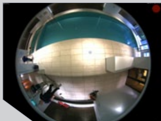
Original Hemispheric Image

RemoteGUARD is the most innovative IP monitoring and surveillance product in Australia, and the most valuable investment you will make for your business.